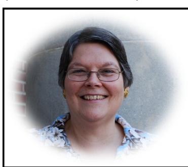
Walden Elementary First Grade Teacher 2012