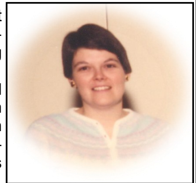
Walden Elementary Kindergarten Teacher 1988